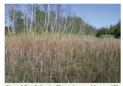
Figure 2 Stand of native Phragmites near Massena, NY. Note red stems.

Phragmites creates dense stands that out-compete other plants for soil nutrients, sunlight, and growing space. It forms large monospecific clones within marshes and wetlands, reducing wildlife habitat value for food and nesting space.