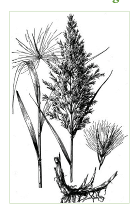
Figure 1 Phragmites australis subsp. australis.

Common reed (Phragmites australis subsp. australis) is one of the "big four" invasive species targeted by the New York State Invasive Species Clearinghouse and its member agencies for special control and management. This tall Eurasian grass infests roadside ditches along the NYS Thruway and other highways, creating visibility and fire hazards as well as maintenance headaches. It also spreads rapidly along railroad lines and inland waterways. It grows on dry sites such as railroad embankments and tolerates prolonged inundation. The common denominator to most of the