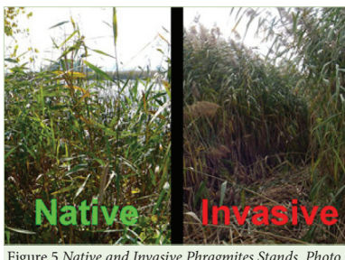
Figure 5 Native and Invasive Phragmites Stands.

Other differences such as glume length and ligule width are best done with a hand lens or a dissecting microscope. Experts also recommend that glumes and ligules of several plants (at least 10 individuals)