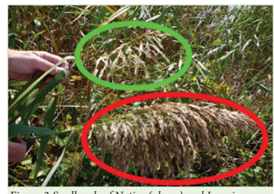
Figure 3 Seedheads of Native (above) and Invasive (Below) Phragmites. Note smaller seed head and more loose spikelets on native form.

More recent work conducted at the University of Rhode Island by Laura Meyerson and her colleagues indicates that hybridization of Phragmites native and non-native genotypes is possible. Meyerson's laboratory was able