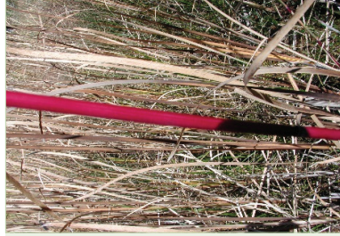
Figure 4 Red stem characteristic of native Phragmites.

So how do we tell the difference between the native variety and the invasive one? As field scientists, most of us do not have the resources or expertise of a genetics laboratory at our disposal. Instead, we must rely on our